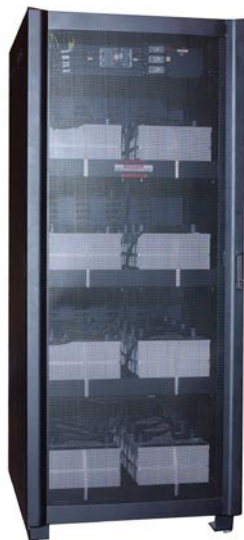
KS3 Cabinet Model

Power Battery offers an extensive line of pre-wired and fused battery cabinets. Standard and custom DC voltages complete with breakers and chargers are available.